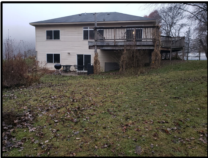
HOUSE VIEW FROM CREEK