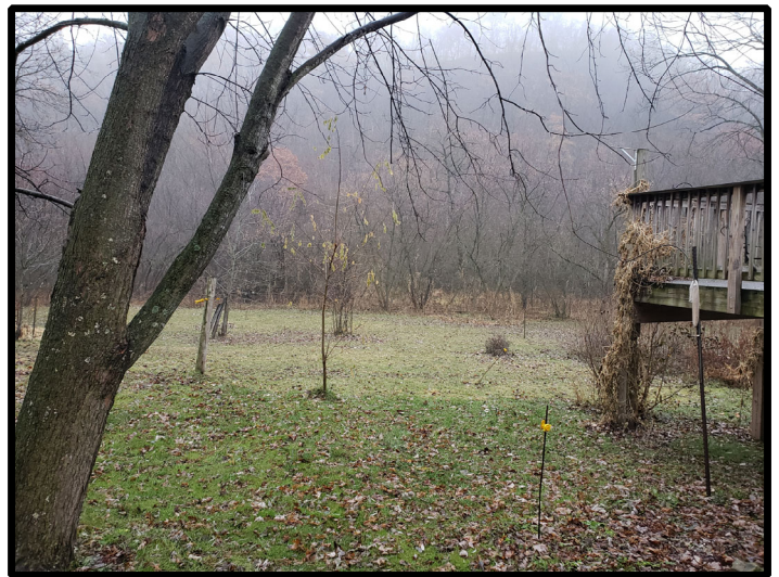
CREEK VIEW FROM HOUSE